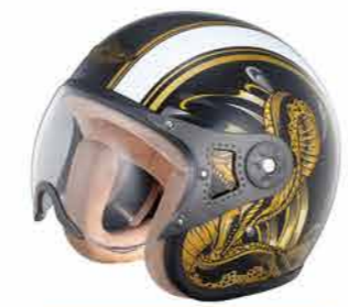
MODEL G-CLASSIC CODE COBRA