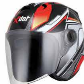
MODEL G626A CODE ID RED