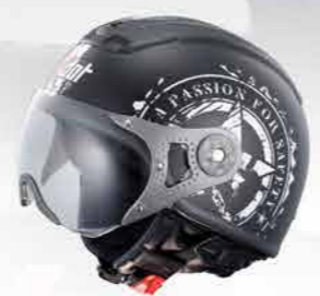
MODEL G66V CODE SS WHITE