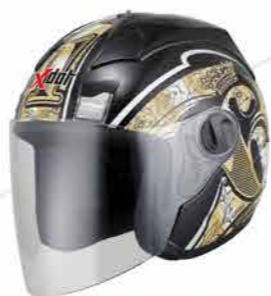
MODEL G616 CODE RSI Q-PRUM