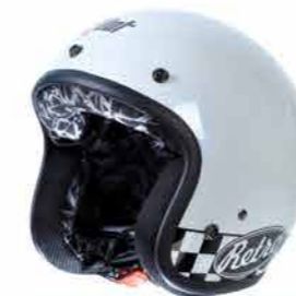
MODEL G55i CODE PEARL WHITE