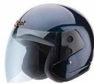
MODEL G518 CODE DARK BLUE