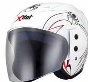
MODEL G718B CODE SD WHITE