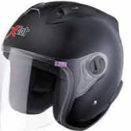
MODEL G626A CODE JET BLACK