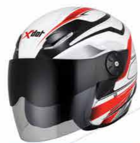
MODEL G606S CODE ST RED