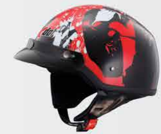
MODEL G7S CODE PROPHECY-RED