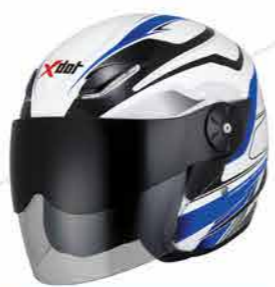
MODEL G606S CODE ST BLUE