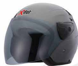
MODEL G618N CODE GRAY