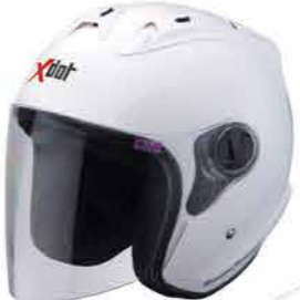
MODEL G626A CODE GLASS WHITE