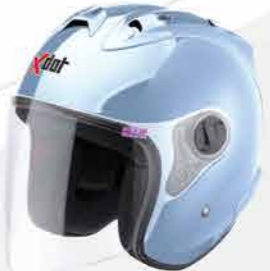
MODEL G626A CODE SAPPHIRE SILVER