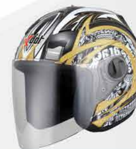
MODEL G616 CODE RS2 Q-PRUM