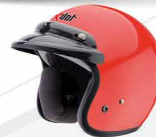
MODEL G55 CODE RED