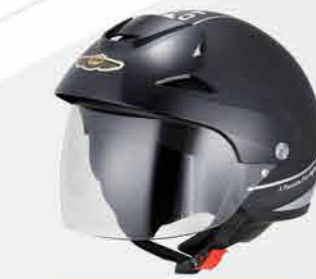
MODEL G118 CODE MATT BLACK-SILVER