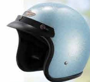
MODEL GLITTER CODE ICE BLUE