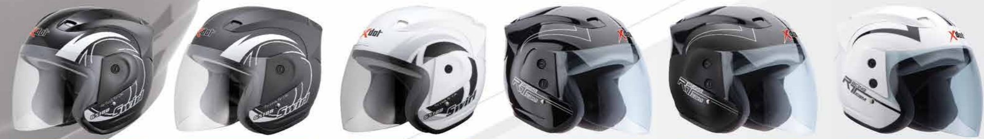
MODEL CODE MODEL CODE MODEL CODE MODEL CODE MODEL CODE MODEL CODE G518B SW BLACK G518B SW MATT BLACK G518B SW WHITE G518B RT BLACK G518B RT MATT BLACK G518B RT WHITE