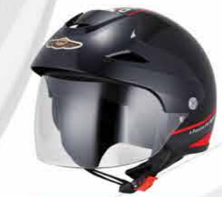
MODEL G118 CODE BLACK-RED