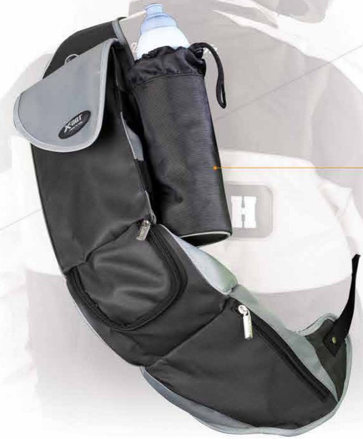
MUMMY BAG CODE BG-MB01