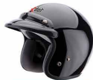
MODEL G55 CODE BLACK