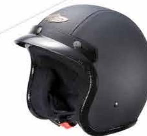
MODEL LEATHER CODE BLACK