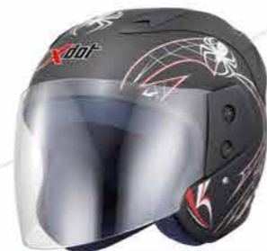
MODEL G718B CODE SD MATT BLACK