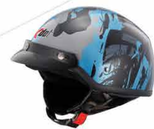
MODEL G7S CODE STREET-LAKE BLUE