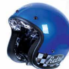
MODEL G55i CODE CANDY BLUE