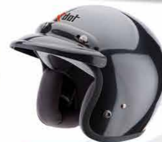
MODEL G55 CODE DARK GRAY