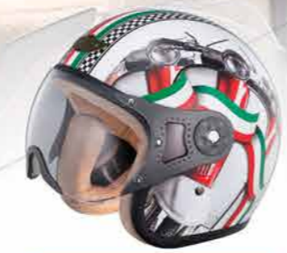
MODEL G-CLASSIC CODE ITALY