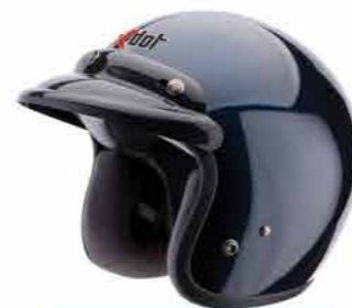
MODEL G55 CODE DARK BLUE