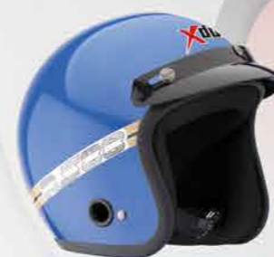
MODEL G88 CODE OC BLUE