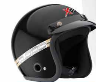
MODEL G88 CODE BLACK