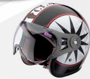
MODEL G-CLASSIC CODE IND BLACK