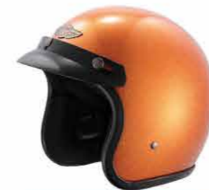
MODEL GLITTER CODE SUNBURST ORANGE