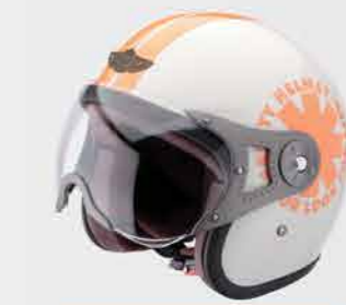
MODEL G-CLASSIC CODE TH BEIGE