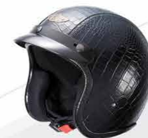
MODEL LEATHER CODE CROC