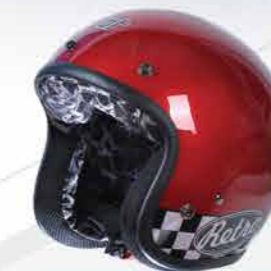
MODEL G55i CODE CANDY RED