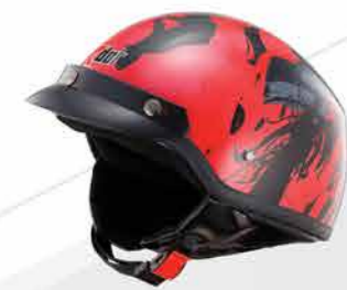
MODEL G7S CODE STREET-RED