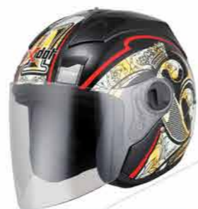
MODEL G616 CODE RSI GOLD