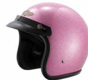
MODEL GLITTER CODE BUBBLE GUM PINK