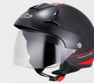
MODEL G118 CODE MATT BLACK-RED