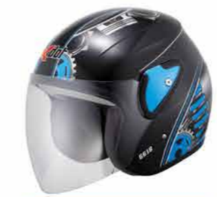
MODEL G618T CODE MH BLUE