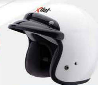
MODEL G55 CODE WHITE