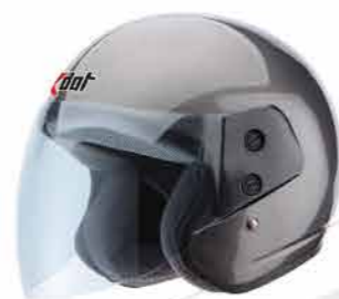
MODEL G518 CODE GRAY