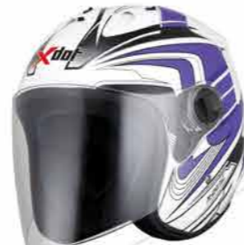
MODEL G626A CODE AR BLUE