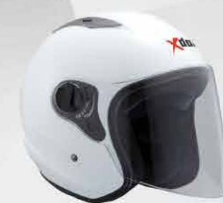
MODEL G626S CODE WHITE