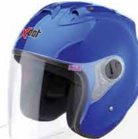
MODEL G626A CODE GLASS BLUE