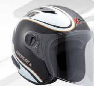
MODEL G626S CODE AF BLACK