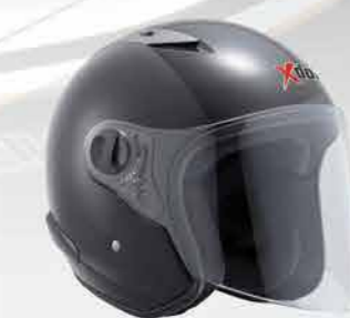
MODEL G626S CODE BLACK