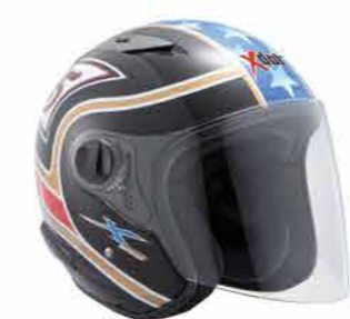
MODEL G626S CODE RC BLACK