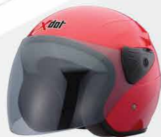
MODEL G618N CODE RED