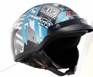
MODEL G7S CODE MUSIC STORM-LAKE BLUE