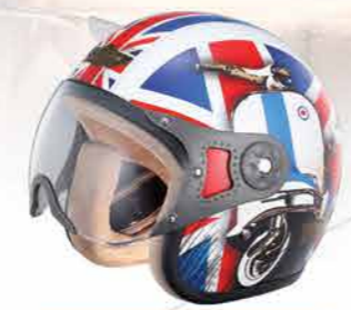
MODEL G-CLASSIC CODE ENGLAND