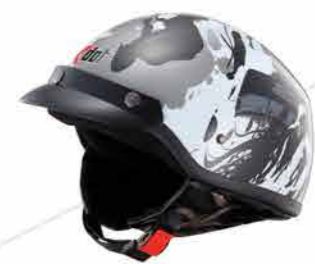
MODEL G7S CODE STREET-BLACK