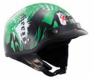
MODEL G7S CODE PROPHECY-GREEN