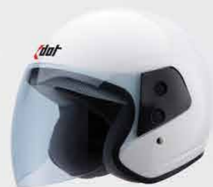
MODEL G518 CODE WHITE