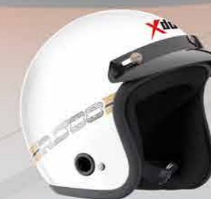
MODEL G88 CODE WHITE