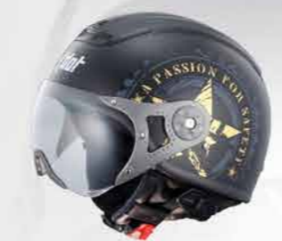
MODEL G66V CODE SS GOLD