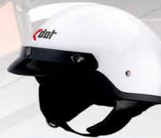
MODEL G7 CODE WHITE