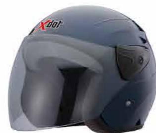
MODEL G618N CODE BLUE