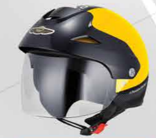
MODEL G118 CODE YELLOW-BLACK