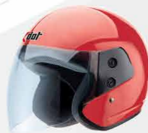
MODEL G518 CODE RED