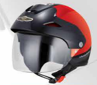
MODEL G118 CODE RED-BLACK