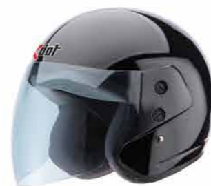
MODEL G518 CODE BLACK