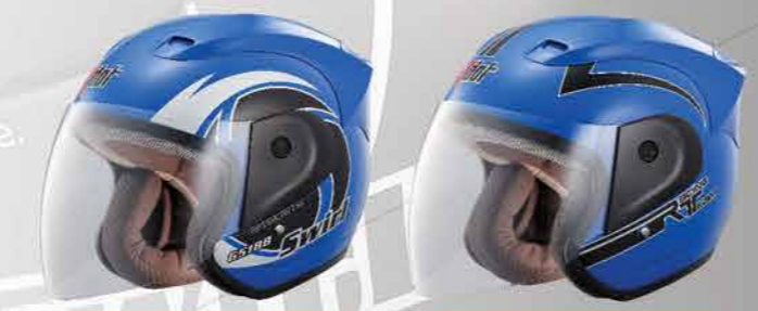
MODEL CODE MODEL CODE G518B SW BLUE G518B RT BLUE