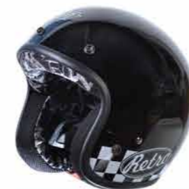
MODEL G55i CODE SOLID BLACK