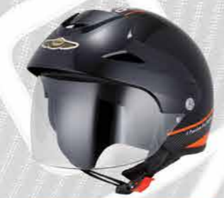
MODEL G118 CODE BLACK-ORANGE