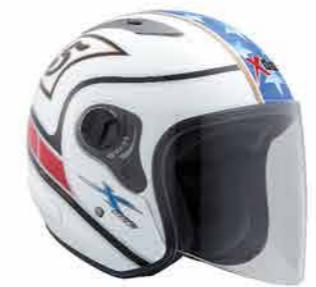
MODEL G626S CODE RC WHITE