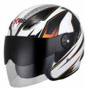
MODEL G606S CODE UB YELLOW