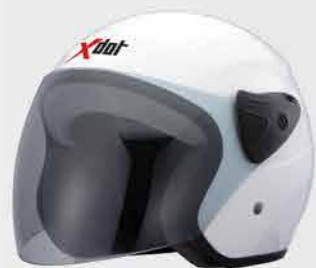
MODEL G618N CODE WHITE