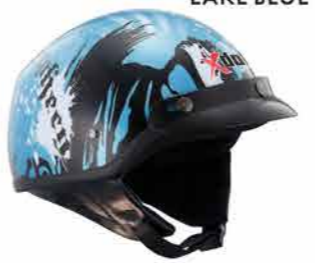
MODEL G7S CODE PROPHECY-LAKE BLUE