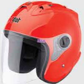
MODEL G626A CODE RED