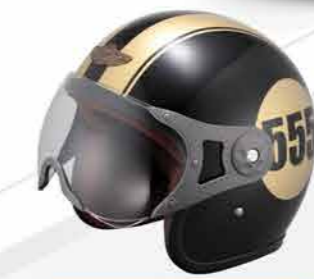
MODEL G-CLASSIC CODE 555 GOLD