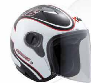
MODEL G626S CODE AF WHITE