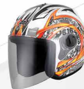
MODEL G616 CODE RS2 FIRE