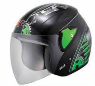
MODEL G618T CODE MH GREEN