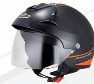
MODEL G118 CODE MATT BLACK-ORANGE