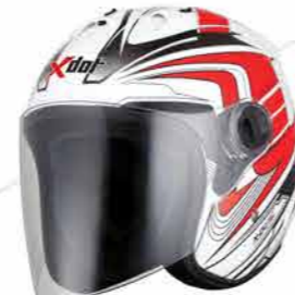
MODEL G626A CODE AR RED