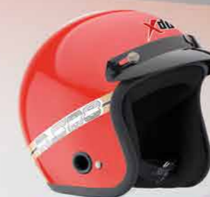
MODEL G88 CODE RED