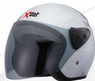
MODEL G618N CODE SILVER