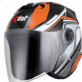
MODEL G626A CODE ID ORANGE