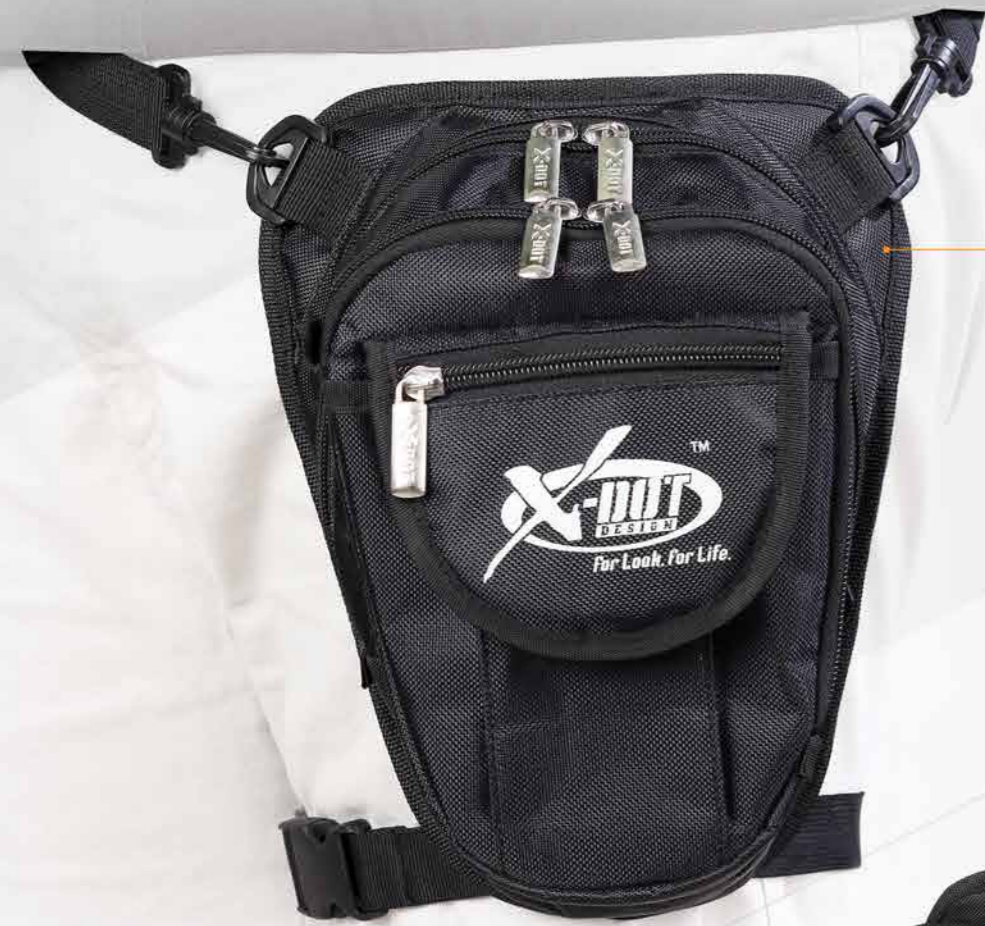
LEG BAG CODE BG-LB01