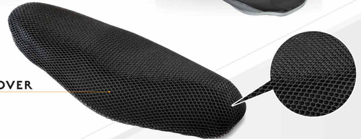
SEAT COVER CODE SC-01