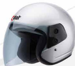
MODEL G518 CODE SILVER