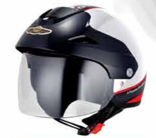
MODEL G118 CODE PEARL WHITE-RED