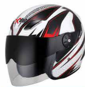
MODEL G606S CODE UB RED