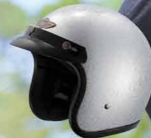
MODEL GLITTER CODE SILVER