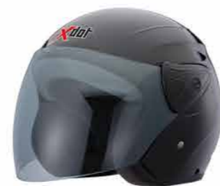
MODEL G618N CODE BLACK