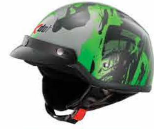
MODEL G7S CODE STREET-GREEN