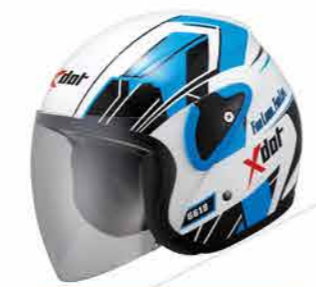
MODEL G618T CODE RG BLUE