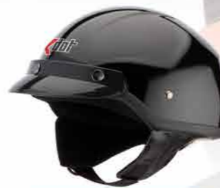
MODEL G7 CODE BLACK