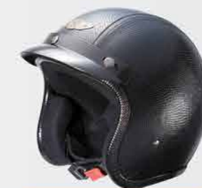
MODEL LEATHER CODE SNAKE