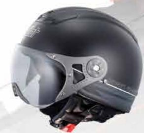
MODEL G66V CODE NR SILVER