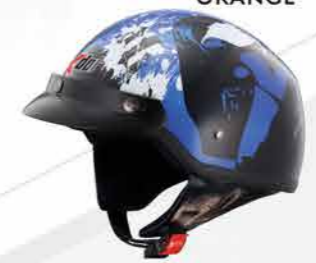
MODEL G7S CODE PROPHECY-BLUE