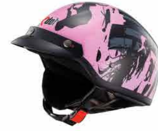
MODEL G7S CODE STREET-PINK