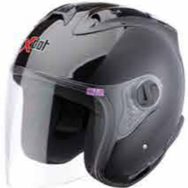
MODEL G626A CODE GLASS BLACK