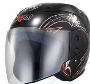
MODEL G718B CODE SD BLACK