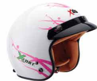
MODEL G8 CODE XC PINK