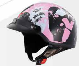
MODEL G7S CODE PROPHECY-PINK