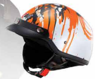
MODEL G7S CODE MUSIC STORM-ORANGE