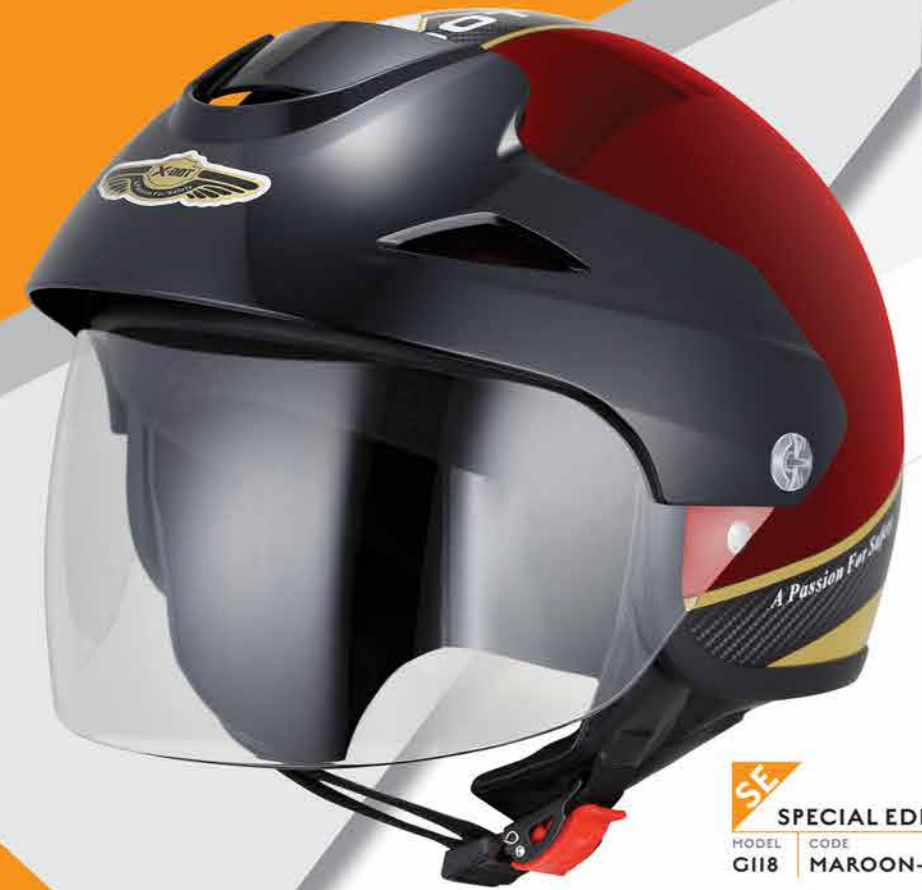
SE SPECIAL EDITION MODEL G118 CODE MAROON-GOLD