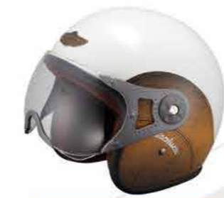
MODEL G-CLASSIC CODE LT BEIGE