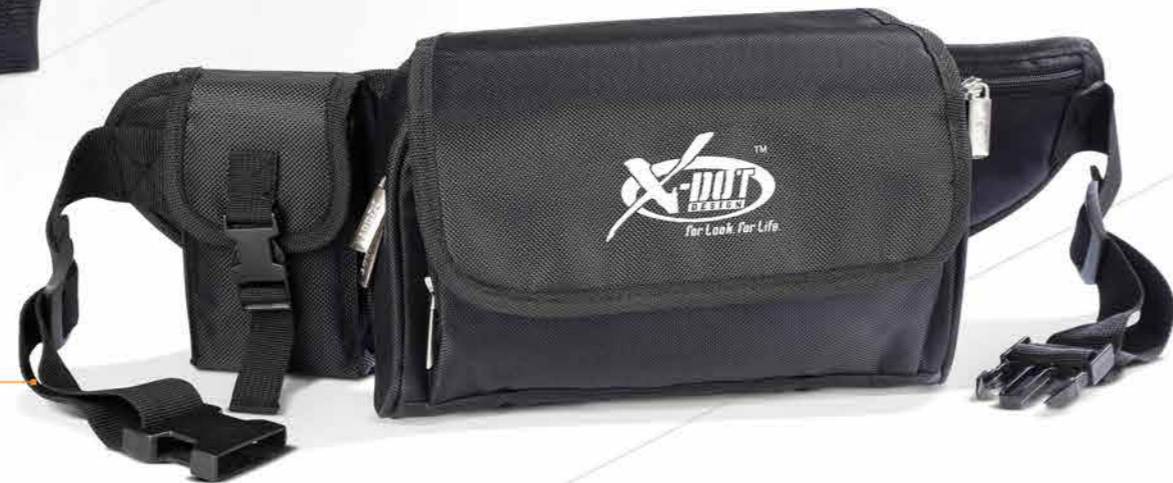
POSH BAG CODE BG-PB03