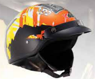
MODEL G7S CODE MUSIC STORM-ORANGE/YELLOW