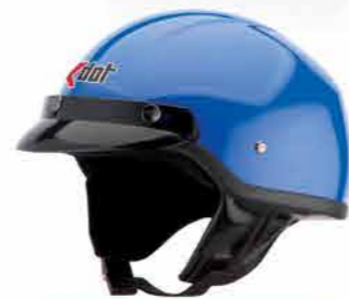
MODEL G7 CODE OC BLUE