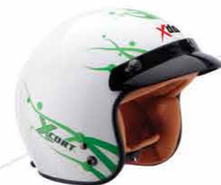
MODEL G8 CODE XC GREEN