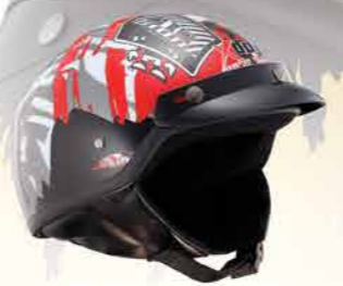
MODEL G7S CODE MUSIC STORM-RED