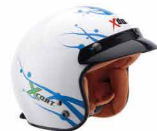
MODEL G8 CODE XC BLUE