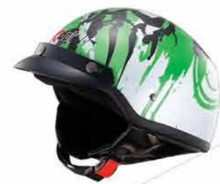
MODEL G7S CODE MUSIC STORM-GREEN