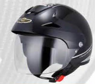
MODEL G118 CODE BLACK-SILVER