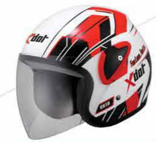
MODEL G618T CODE RG RED