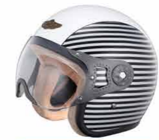
MODEL G-CLASSIC CODE CARBON