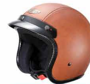
MODEL LEATHER CODE BROWN