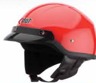
MODEL G7 CODE RED