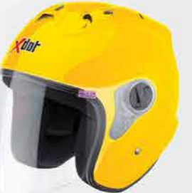
MODEL G626A CODE YELLOW