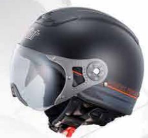
MODEL G66V CODE NR ORANGE